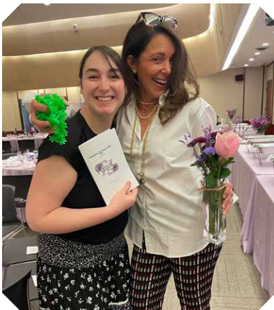
Sisterhood Women's Seder