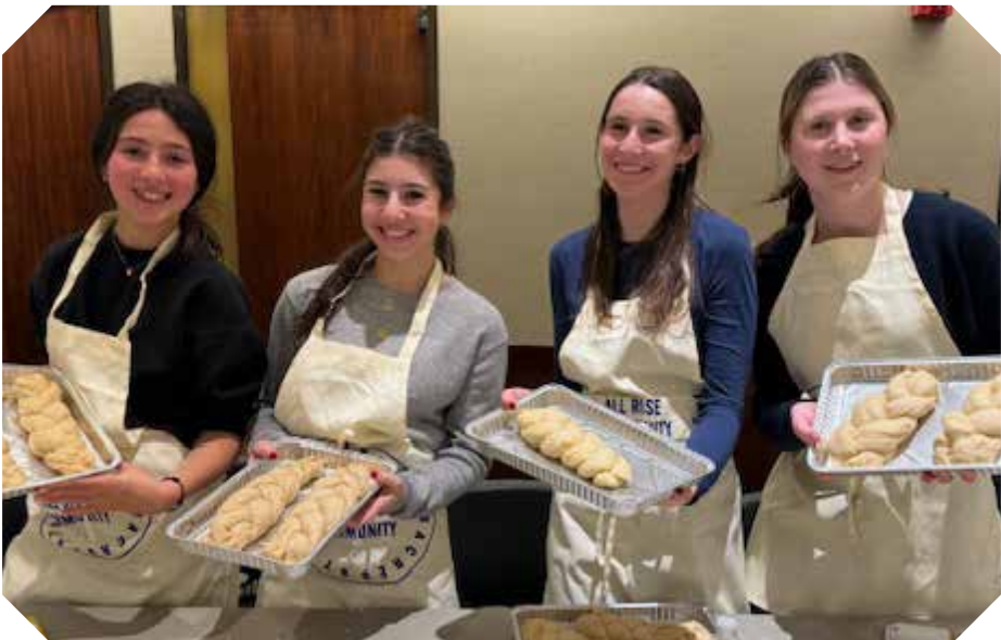
Backpack Buddies Challah Bake